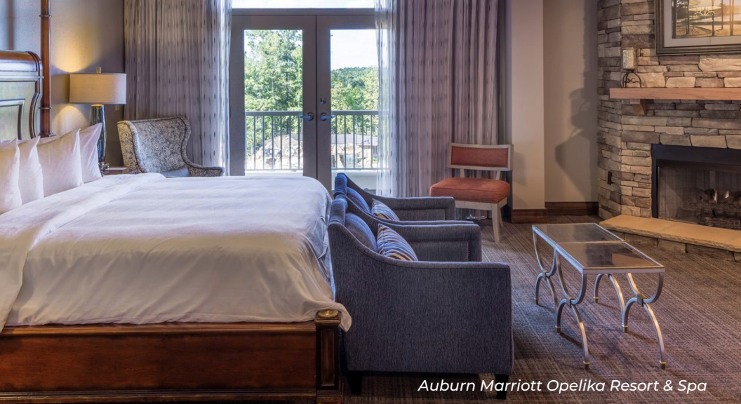
Auburn Marriott Opelika Resort & Spa

In-Town Suites 1188 Commerce Dr • 334-826-1123