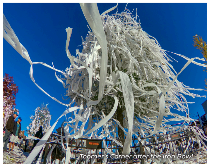
Toomer's Corner after the Iron Bowl

One of Auburn's oldest and most renowned traditions, thousands of AU faithful will join in downtown Auburn to celebrate tiger victories by hurling tissue into the surrounding trees, lamp posts, and anything that will stand still long enough.