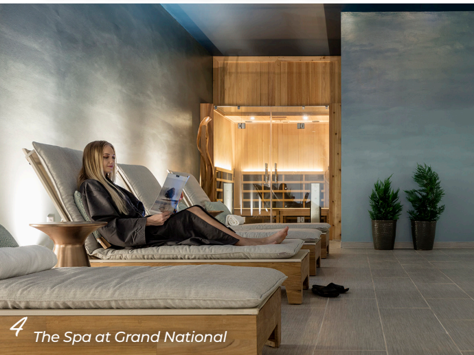
4 The Spa at Grand National