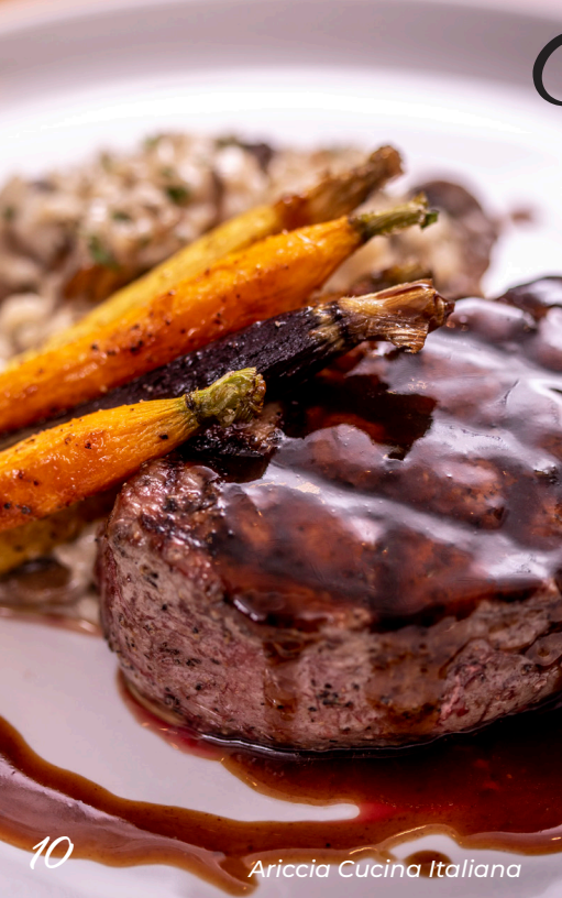
Ariccia Cucina Italiana

Inspired by a hilltop town of palaces, vineyards, and poets, Ariccia Cucina Italiana opened in 2001 in partnership with Auburn University and its sister campus in Ariccia, Italy. It's a modern escape focusing on the best Italian food, wine, and community. Ariccia honors the classic central Italian cuisine, focusing on the freshest seasonal products, Italian meats & cheeses, signature Porchetta, house-made focaccia and wood-fired pizzas. Located inside The Hotel at Auburn University, Ariccia is an upscale casual restaurant offering an intimate setting from