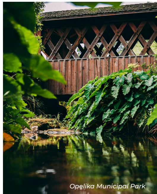
Opelika Municipal Park

Home of a vintage miniature train, the beloved Rocky Brook Rocket, and the relocated Salem-Shotwell covered bridge. The park offers children's play areas and equipment and features a pavilion and gazebo with picnic areas available to rent for private functions. Home of Summer Swing. Open sunrise to sunset. Denson Dr, Opelika • 334-705-5549