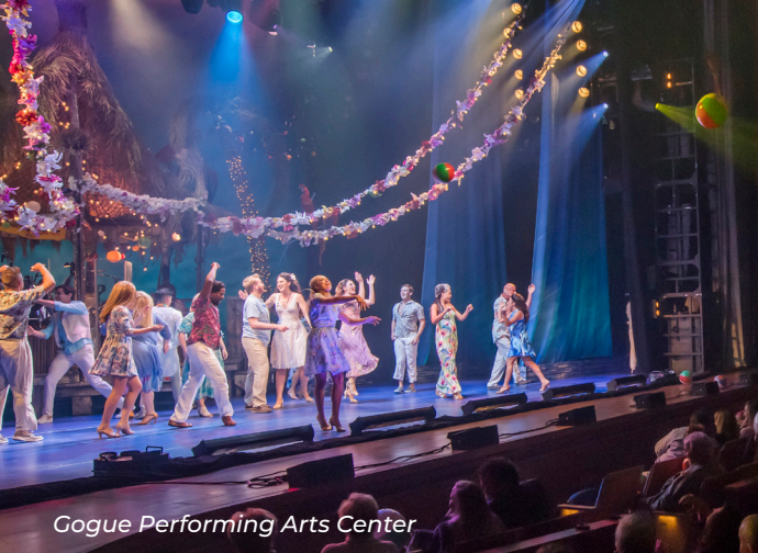
Gogue Performing Arts Center