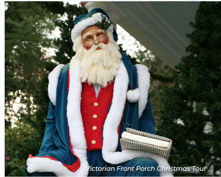
Victorian Front Porch Christmas Tour

From one-of-a-kind annual events to carol concerts, tree lightings, and the most unique gingerbread village in the Southeast, we've got everything you need to celebrate your reason for the season.