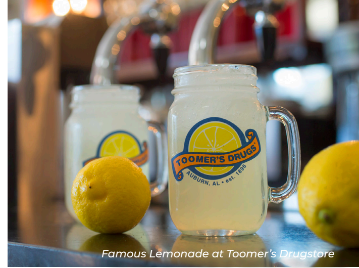
Famous Lemonade at Toomer's Drugstore

When Toomer's lemonade ranked number one in Esquire's "162 Reasons It's Good To Be An American," it was only about 105 years after the rest of us already knew. Hand-made to order, this tart & tangy concoction is the hallmark of Toomer's Drugstore, a beloved Auburn icon since 1896.