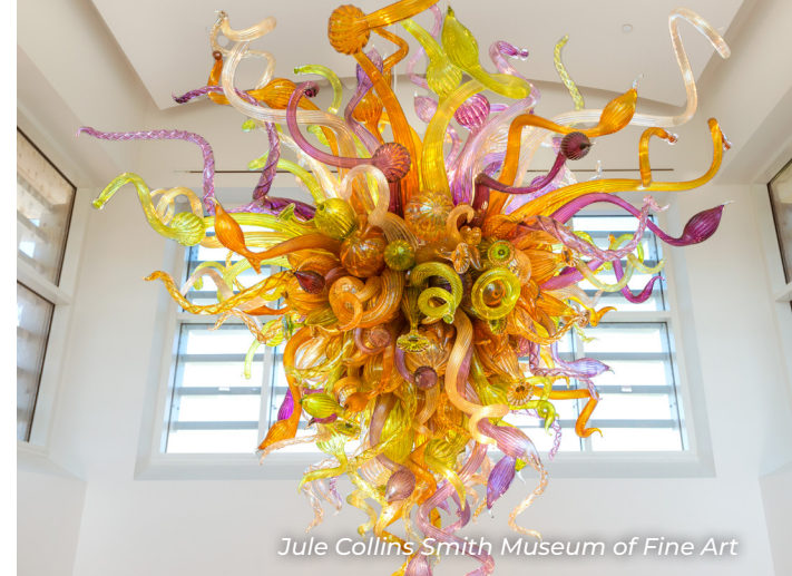
Jule Collins Smith Museum of Fine Art

The focal point for the entry of the Jule Collins Smith Museum of Fine Art at Auburn University, Chihuly's Amber Luster is a masterpiece of more than 600 individual pieces of hand-blown glass. It took four days to install, one piece at a time.