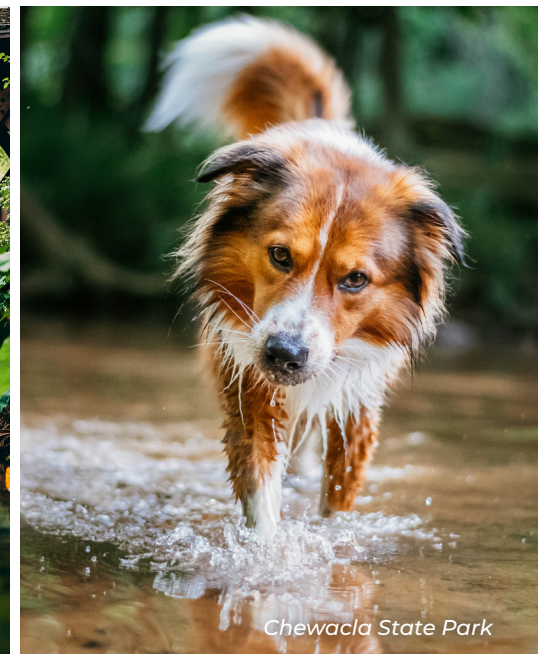
Chewacla State Park