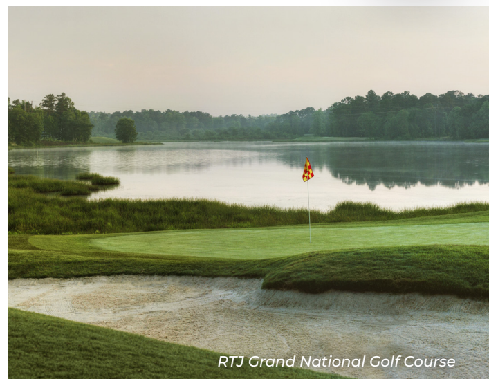
RTJ Grand National Golf Course

Robert Trent Jones himself proclaimed Grand National the “single greatest site for a golf course” he had ever seen. Grand National has received accolades for everything from the “world’s prettiest hole” to the “world’s best public course.”