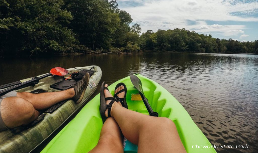
Chewacla State Park

From parks to play bills, we offer a variety of places and ways for your family to unplug and engage. Both cities offer spacious, well-maintained parks and facilities for outdoor play or spectator sports, and Auburn University has a full calendar of events so you can take in some of the best collegiate sports action in the U.S.