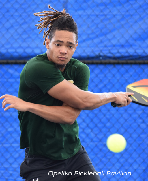
Opelika Pickleball Pavilion