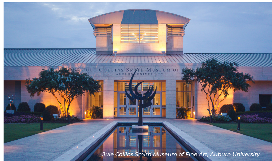
Jule Collins Smith Museum of Fine Art, Auburn University

Scan for more info on the arts & culture in Auburn-Opelika