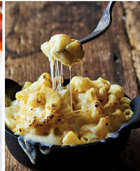
Bow & Arrow