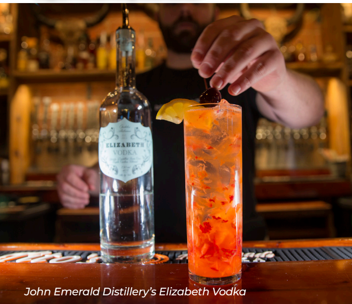
John Emerald Distillery's Elizabeth Vodka