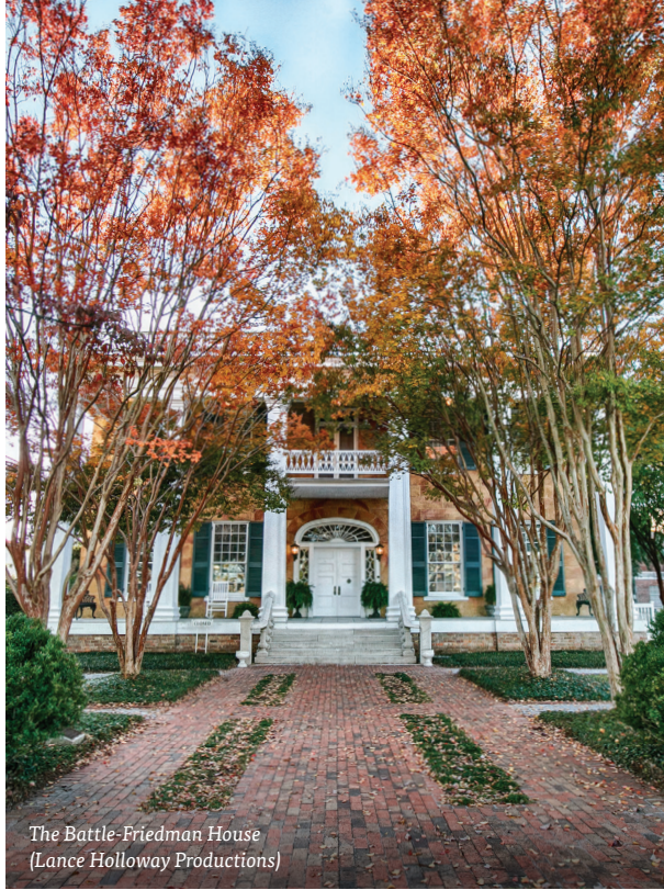
The Battle-Friedman House

History runs deep in Tuscaloosa County. Dive into the area's past to understand how it shaped the present.