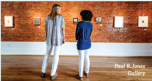
Paul R. Jones Gallery